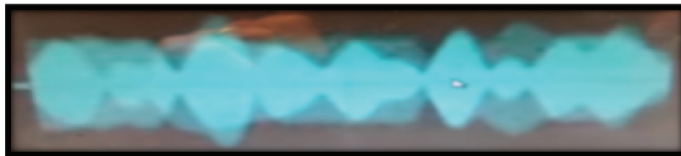
Spread-Spectrum Frequency Hopping Oscilloscope Tracing

The above is an example of what our energy waves may look like during a treatment program.